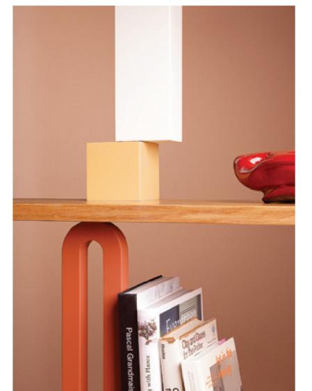
STEPHANY HILDEBRAND X4